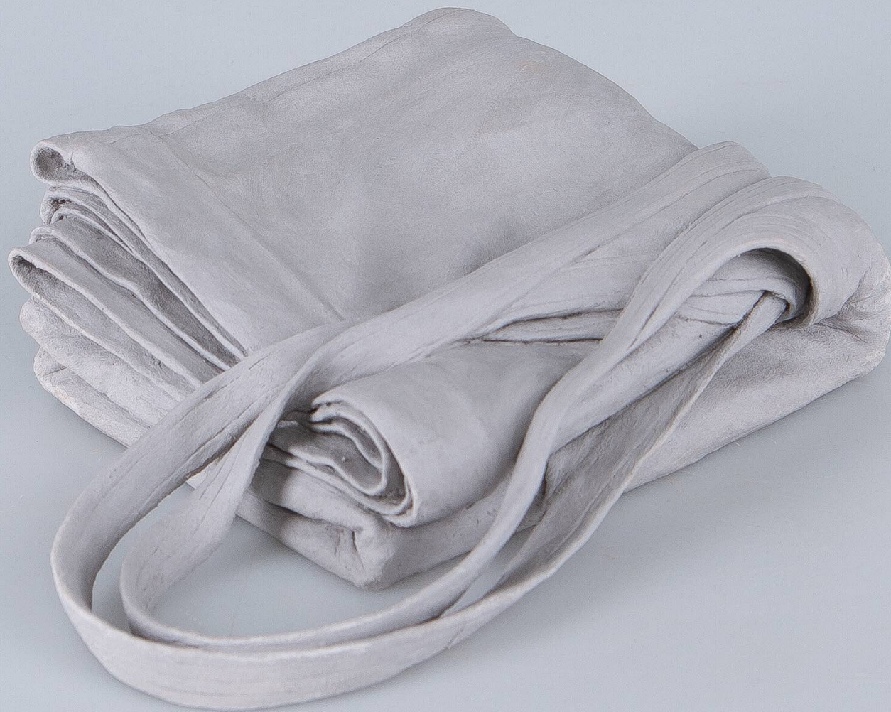
untitled, 2023 stoneware 12 x 17 x 5 cm