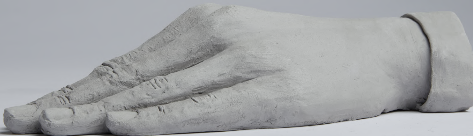
untitled, 2023 stoneware 21 x 10 x 5 cm