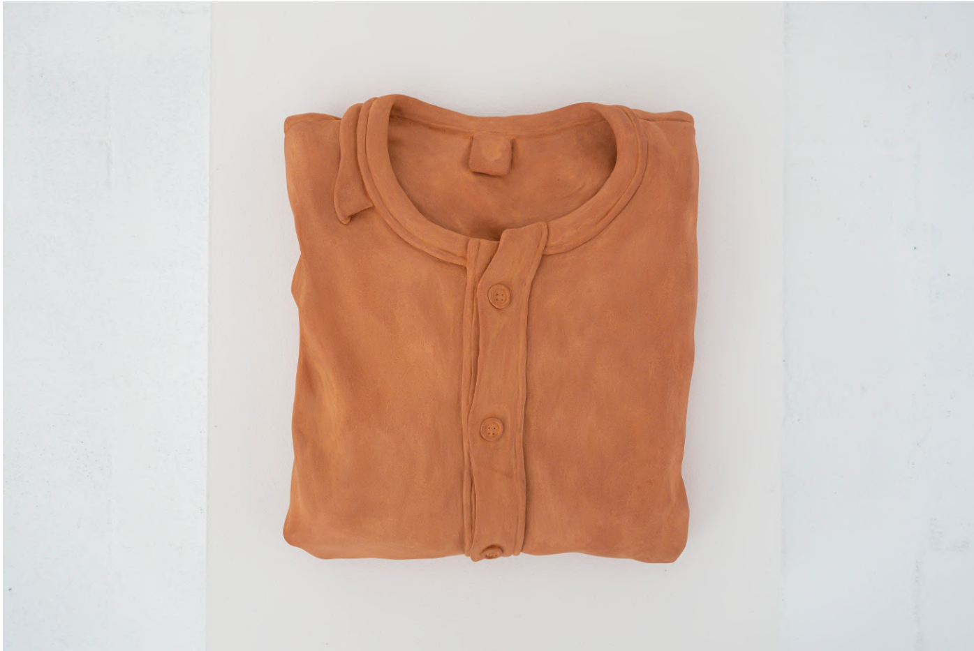
untitled, 2022 earthenware 30 x 23 x 4 cm