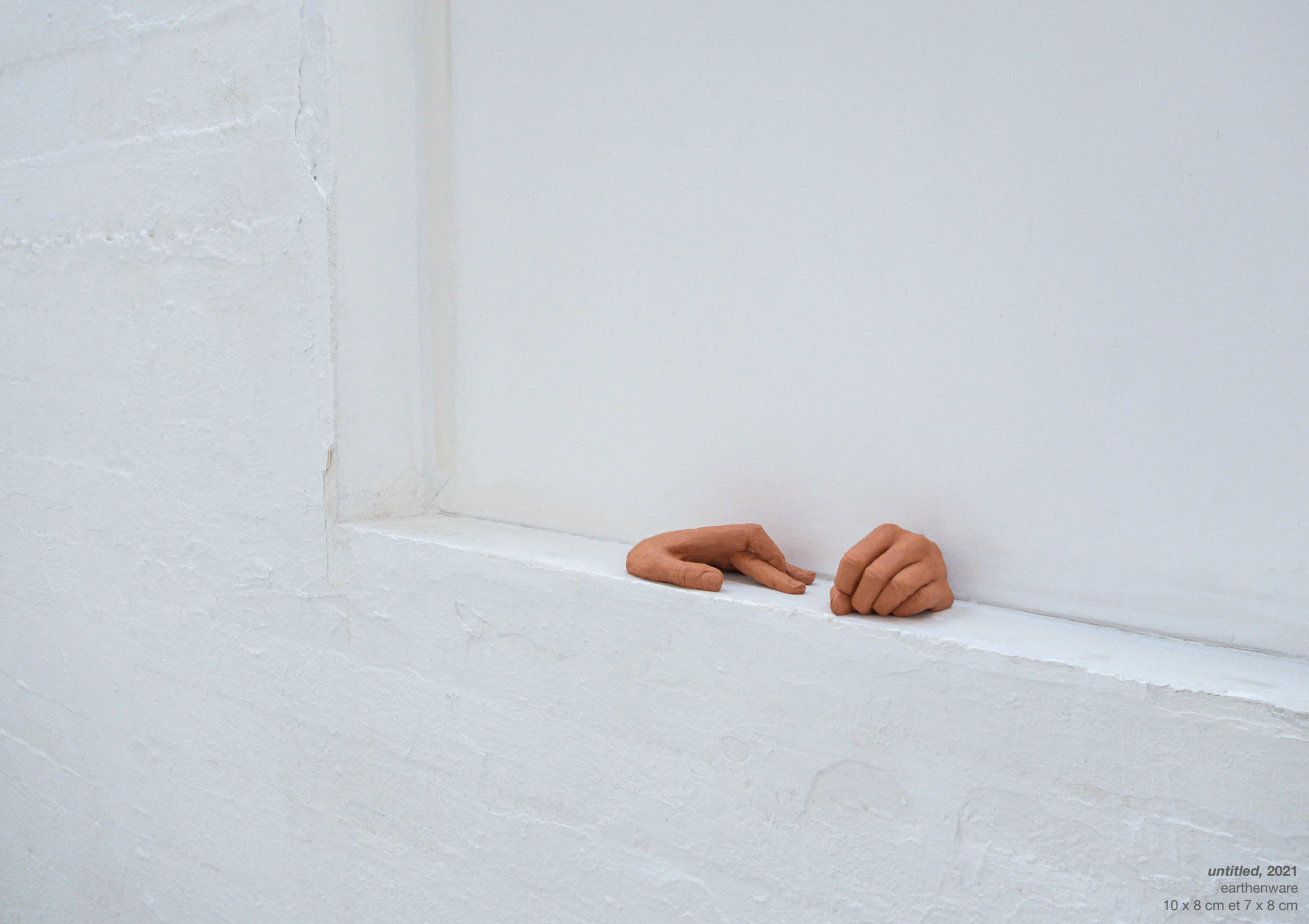
untitled, 2021 earthenware 10 x 8 cm et 7 x 8 cm