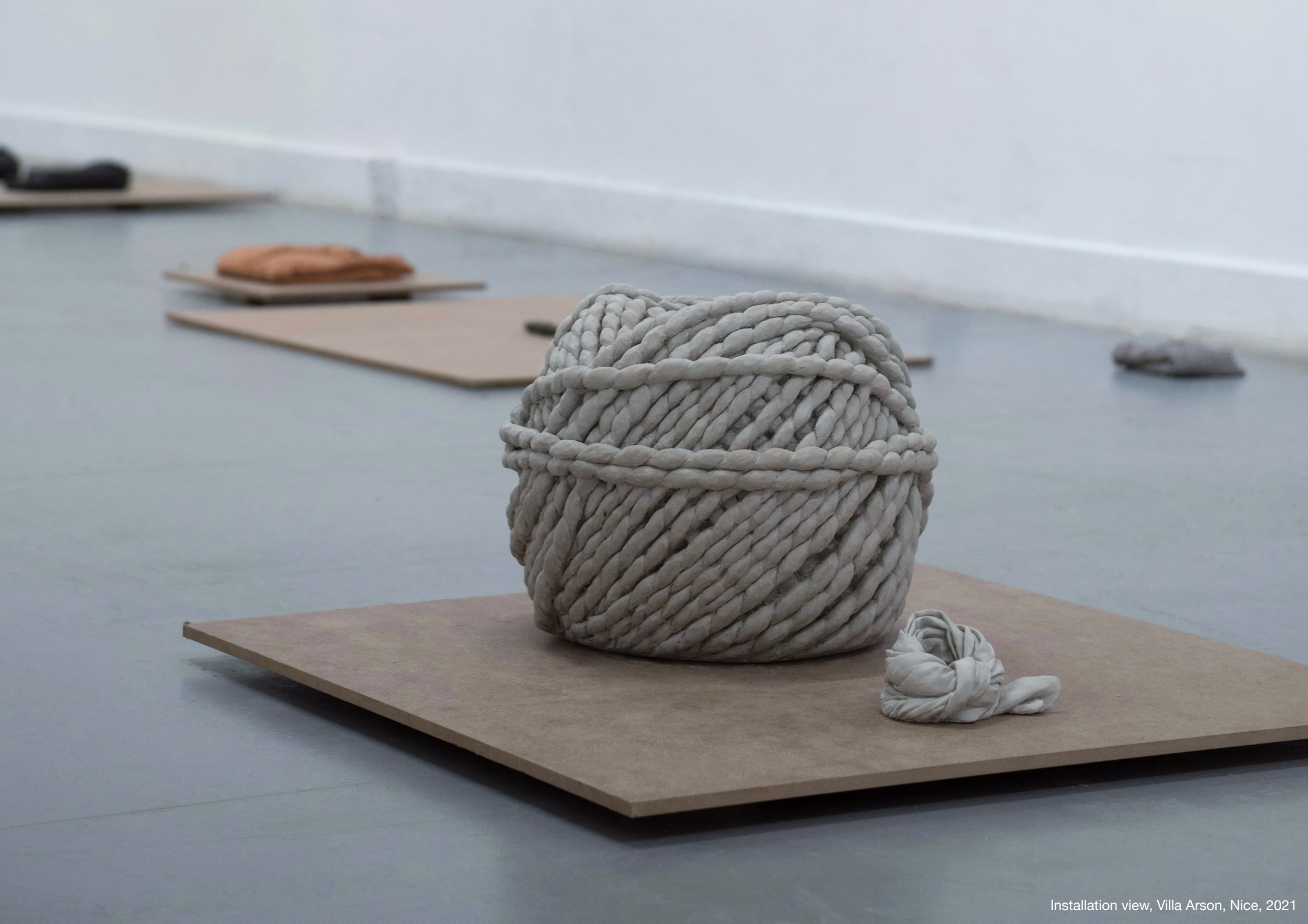
Installation view, Villa Arson, Nice, 2021