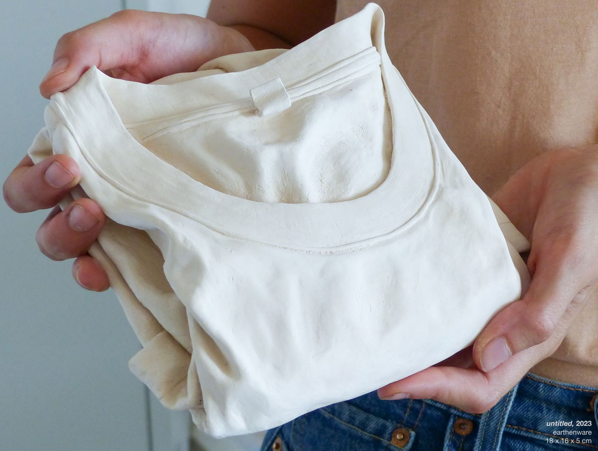
untitled , 2023 earthenware 18 x 16 x 5 cm