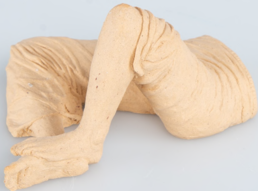
untitled , 2022 stoneware 8 x 5 cm