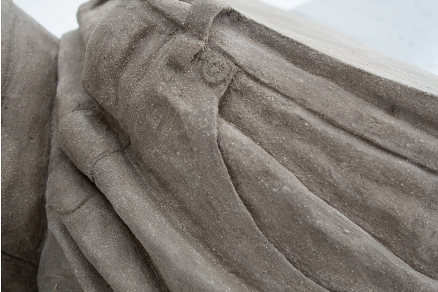
untitled, 2022 stoneware 51 x 65 x 45 cm