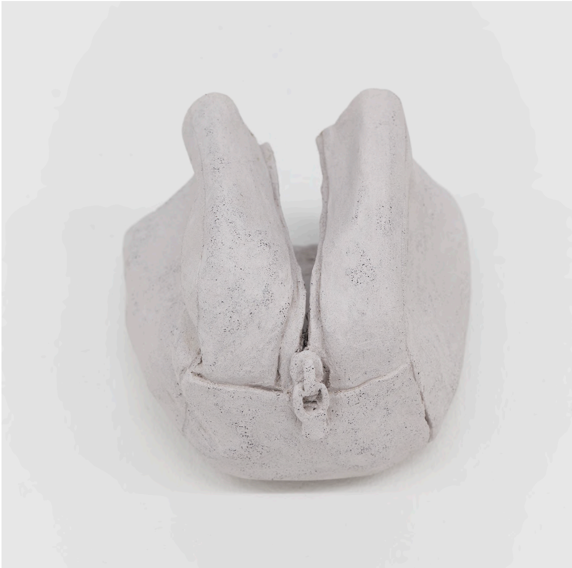
untitled, 2023 stoneware 7 x 8 x 6 cm