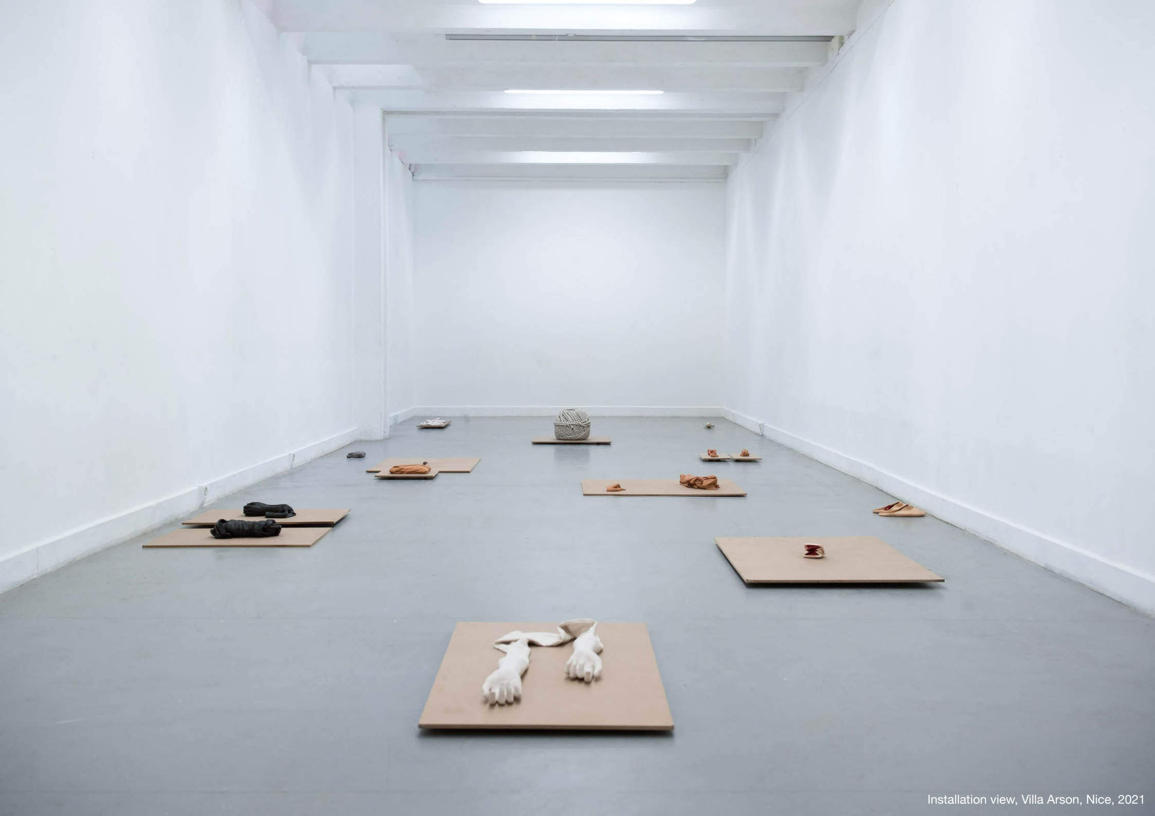
Installation view, Villa Arson, Nice, 2021