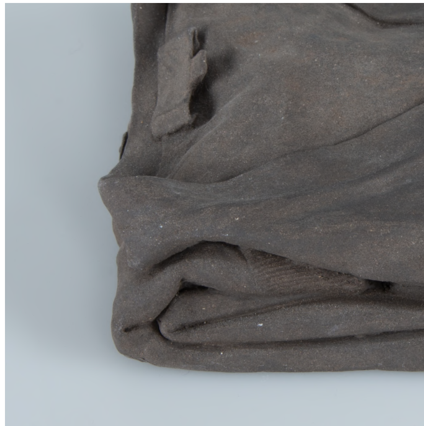
untitled , 2021 stoneware 10 x 9 cm